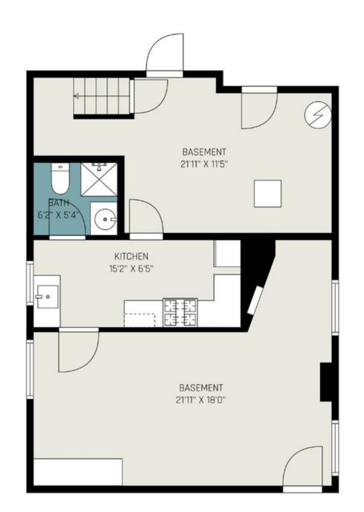
Top floor Unit